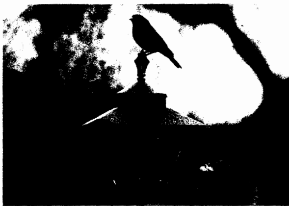
Yellow-headed Blackbird, Hershey, 4/11/90.